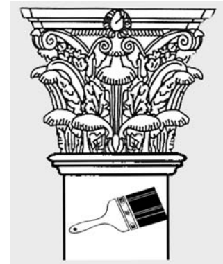
Fig. C – Apply a high quality primer before painting.