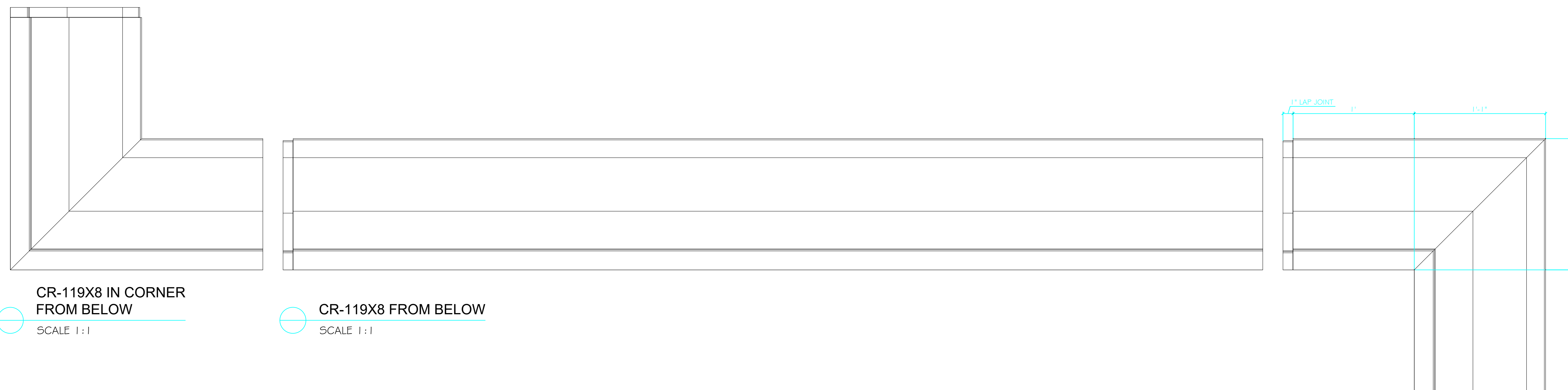
CR-119X8 IN CORNER FROM BELOW SCALE 1:1