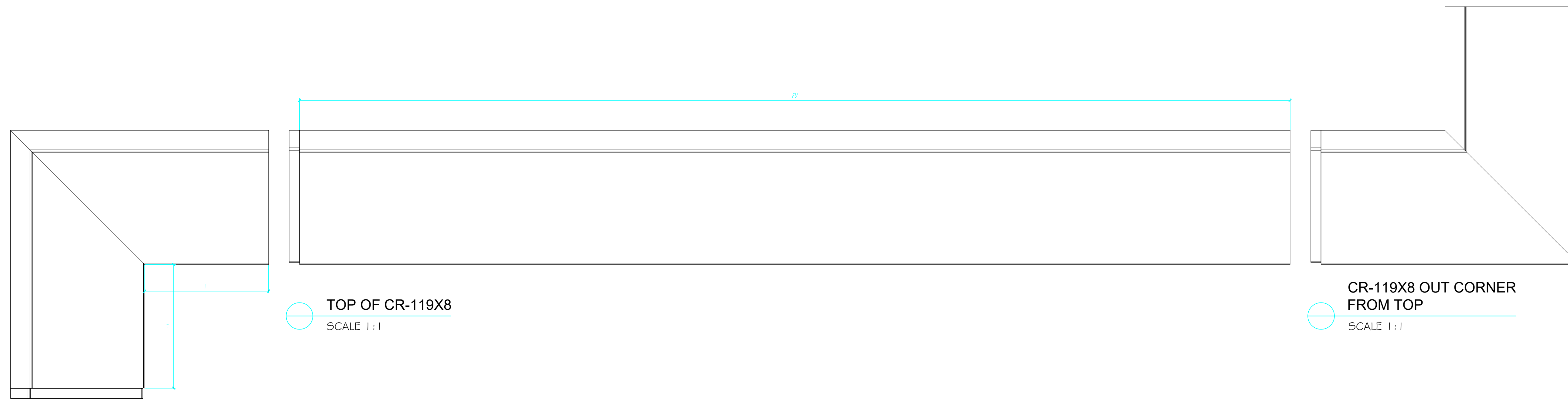
TOP OF CR-119X8 SCALE 1:1