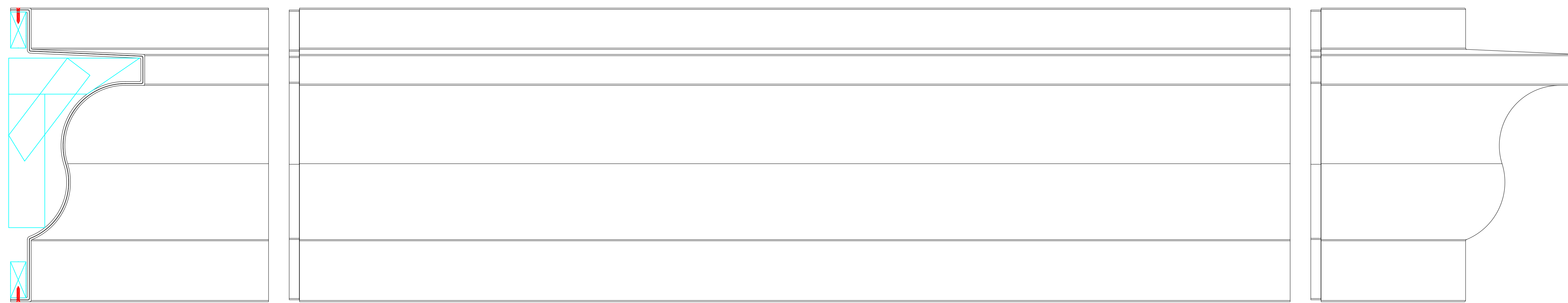
ELEVATION OF CR-119X8 IN CORNER SCALE 1:1